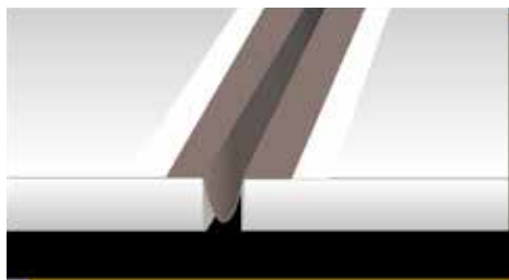
Positioning Mapeband PE 120 in an omega pattern in an expansion joint